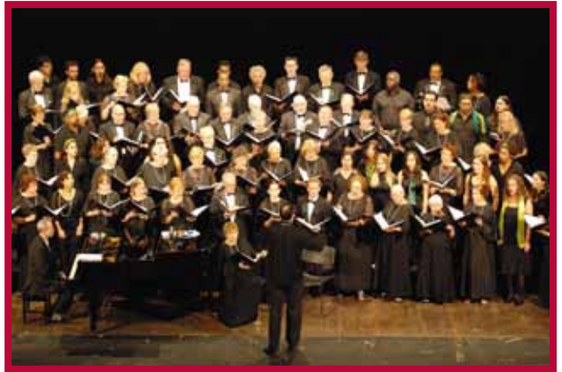
Brazil - Juiz de Fora Combined three choirs

MUSIC THEATER LANGUAGE NATURE TRADITIONS CELEBRATIONS VITICULTURE MARKETS