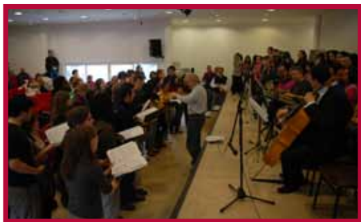
Musical sharing at school, Turkey

Thanks to email and Skype, it is much easier to share planning with colleagues, even in remote parts of the world, than it used to be (though internet access is still not as fast or available in many parts of the world as it is in the West). Sometimes it is only possible to perform as separate choirs on the same program. But the benefits are so much greater if the choirs also sing at least one piece from each other’s repertoire together, under each other’s conductor.