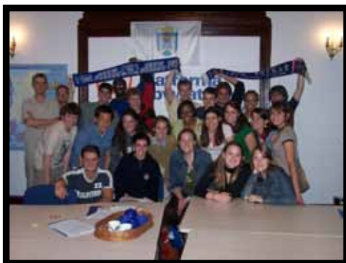
Pre-concert meeting with Young Democrats 3, Poland

In an academic choral program, choosing a region to visit where a faculty colleague has research interest or familial roots can make student preparation for the exchange much richer. This can be especially fruitful in colleges that are small enough to enable collaborative teaching in preparation for a tour. My last three college tours have involved other faculty in teaching, helping to make local arrangements, and going along on the trip itself as a co-leaders and teachers. In addition, these faculty have brought along non-singing students with special academic interest in the culture being visited. These students have loved being part of the experience, and become the perfect advocates back home for what makes collaborative choir tours special.