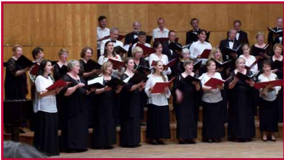
Bucks County Choral Society combined choirs in Timisoara, Romania

So how to go about choosing choirs with whom to seek collaboration? There are usually a number of overlapping considerations. To make sure the musical part of the collaboration can work, it is good to seek out cultures with a vibrant indigenous choral tradition where choirs of your peers (students or community members) are active and available at the time of year you can travel. This will tend to rule out summertime travel to countries in the northern hemisphere, but there are many countries below the equator in South America, South Africa, and Asia that are ripe for choral collaborations when our summer is their winter.