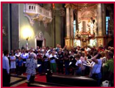
Bucks County Choral Society combined rehearsal in Budapest

This article will try to outline briefly some of what I have found to be important ingredients for successful collaborations. Some of these suggestions are directly related to travel abroad, but many can be applied to local collaborations as well. (In the case of community choirs, where it can be more difficult for many singers to participate for financial reasons or because of work and family obligations, planning a combined tour with another community choir in your area can bring all the benefits of collaboration close to home with those of encountering people in an unfamiliar culture abroad.)