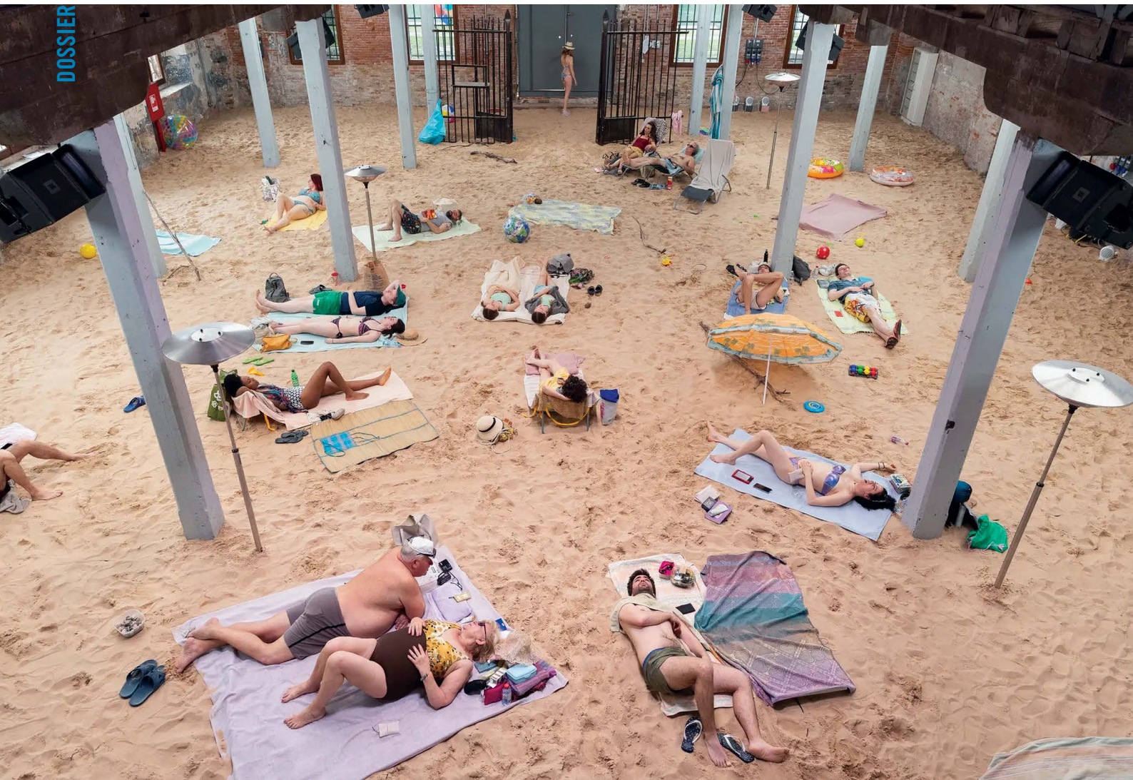
Sun & Sea Opera at the Philly Fringe Festival 2019

Perhaps if we abandon our need to be seen as representing an abstract, lofty “world” standard of artistic value to be held over all musical genres and styles rather than just our own, we might find authentic artistic identities again. Can we find ways to express our individual and communal passions and contradictions, without sentimentality, but also with life, color, and individuality?